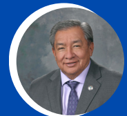
Senator Benny Shendo, Jr.