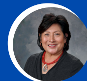
Rep. Charlotte Little